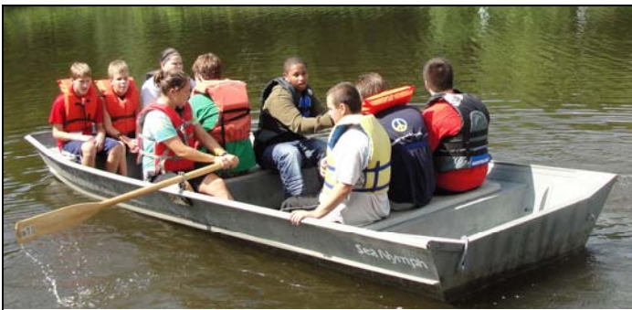
Campers go boating on Redbird Lake at Stepping Stones Given.

Stepping Stones Center will hold its first ever Camp Fairs for campers and families considering Stepping Stones' day or overnight camps for children or adults with disabilities. All first-time campers must attend a Camp Fair. Fairs also are open to returning campers and families who want to learn more about Stepping Stones Center's Day and overnight Camping or other programs for children and adults with disabilities. The fairs are March 26, April 17 and May 15 at Stepping Stones Given, 5650 Given Rd., Indian Hill, 45243 and on April 16 and May 14 at Stepping Stones Allyn, at Camp Allyn, 1414 Lake Allyn Rd., Batavia, 45103. To reserve space, call Marcie Brooks at 513-831-4660. Stepping Stones is a United Way partner agency. Web site is www.steppingstonescenter.org . Fair times vary in the afternoon. First time camp families must reserve a space to meet with camp staff for one-on-one discussions of their child's needs.