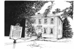
Buckingham Lodge 1861