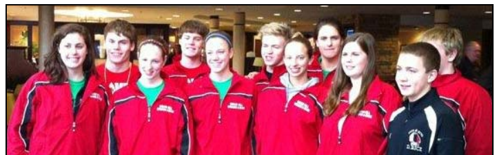
Indian Hill High School team members