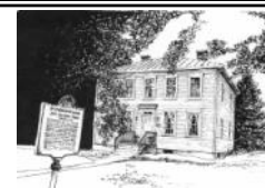
Buckingham Lodge 1861