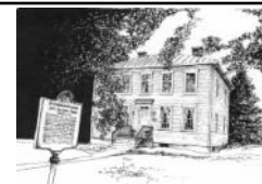
Buckingham Lodge 1861