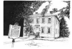
Buckingham Lodge 1861