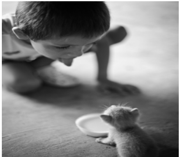
Ilana Habib (Blue Ash)