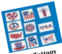
Put Tattoos On The Kids