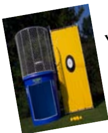
WORK IN DUNK BOOTH