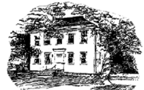
Buckingham Lodge 1861