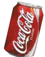
Hand Out Cokes