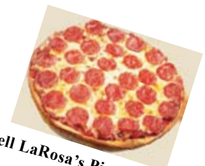
Sell LaRosa's Pizza Slices