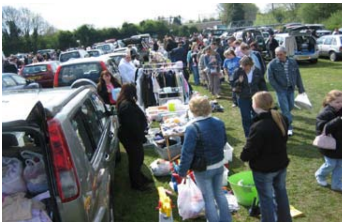
An English Garage Sale