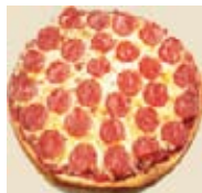
Help sell LaRosa's Pizza