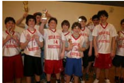
Who says trophies aren't important?