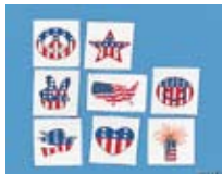
Put Tattoos on The Kids